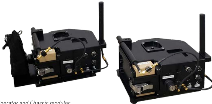
Operator and Chassis modules.

Products, product specifications and data are subject to change without notice to improve reliability, function, and/or design. Please contact Customer Service at 800.969.8527 for the most up-to-date product information.